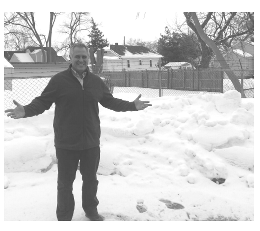
All dressed up and "snow"-where to go. The plow filled my parking spot with a snow mound.

remember cold winters. But I don't recall a winter that has been all three: so much snow with such cold temperatures for such a sustained period of time. Of course, I am writing this in mid-