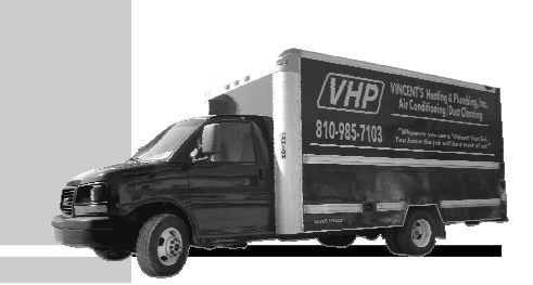
'Wherever you see a Vincent's Van Go' you know the job will be a work of art."